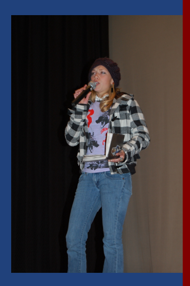
Governor's Commission on Community Service The 2008 AmeriCorps State Service Conference Review