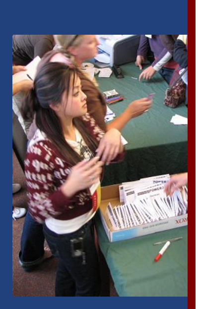
Governor's Commission on Community Service The 2008 AmeriCorps State Service Conference Review