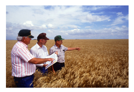
All workers involved with PMP crop production must participate annually in an APHIS-approved training program on the required procedures for growing these crops.